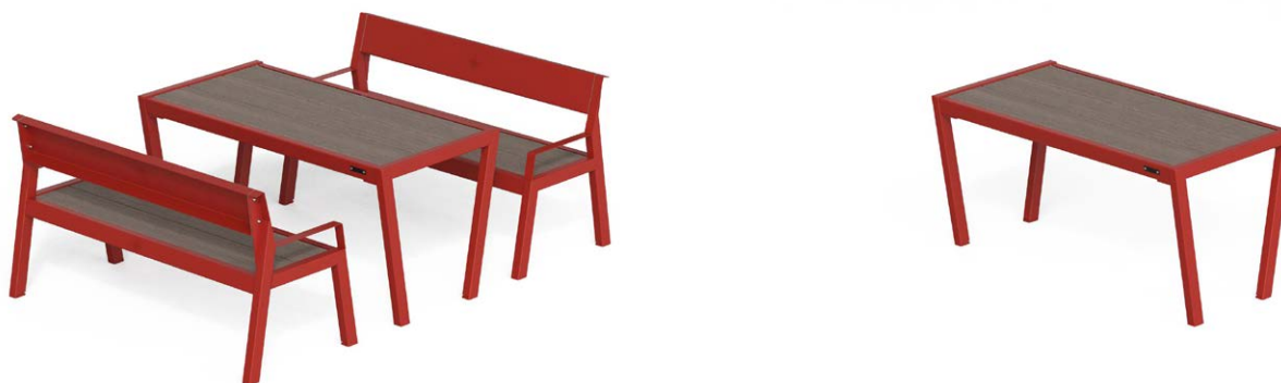
Table consisting of two inclined supports in 40x30x1.5 mm tubular steel with 3 mm thick folded steel sheet frame and WPC slats. All metal parts are galvanised and coated with thermosetting polyester powder. All fixings are in AISI304 stainless steel. Prepared for ground fixing through M10 threaded bars to cement (included).